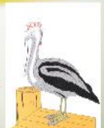
Northlake AORN Chapter 1908