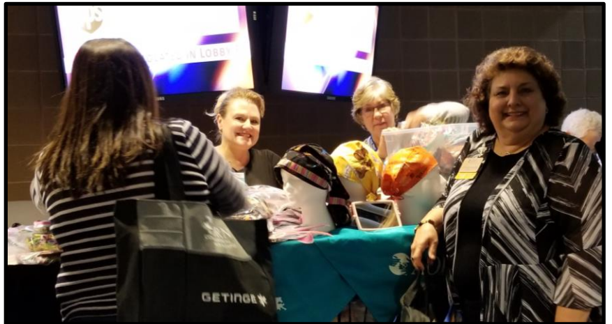
Madam President visiting the Louisiana State Council booth.