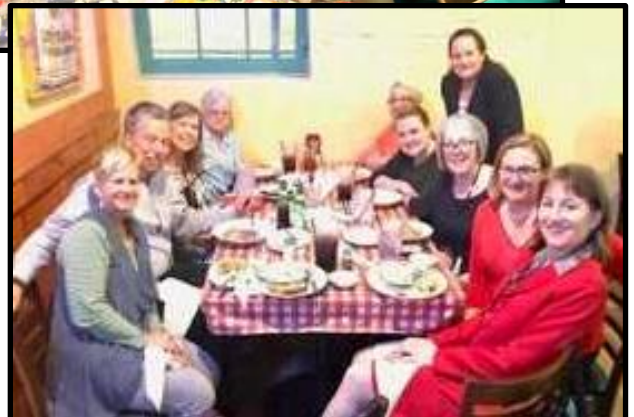
State Council meeting at Mulate's.