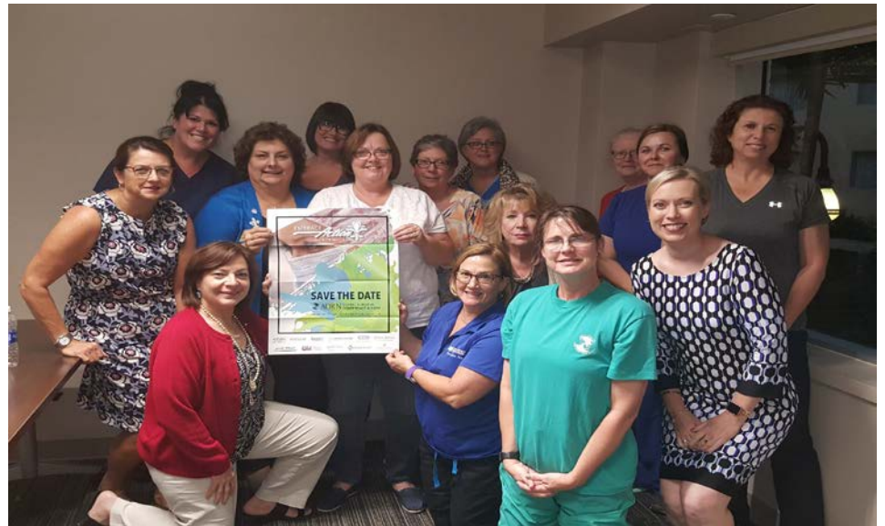
Photo from the Ochsner Jeff Hwy meeting

Save the date! Expo is March 24-28, 2018